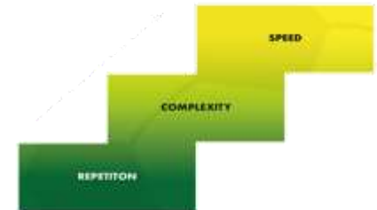
BALL MASTERY PATHWAY ©2022