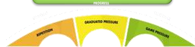
THE COERVER® SKILLS BRIDGE©2009