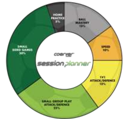
THE COERVER® SESSION PLANNER©2009