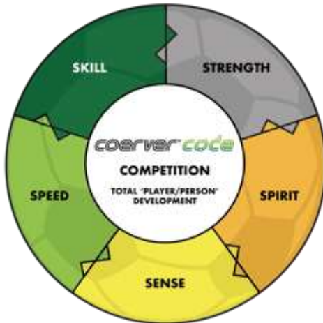
THE COERVER CODE©2010